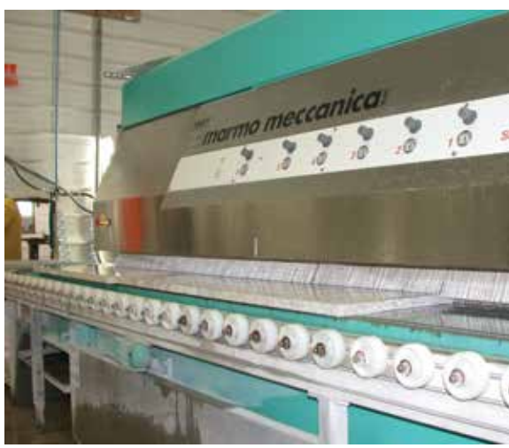
High-speed water jets polish recently cut decorative stone at AMC of Wisconsin to make smooth countertops.

The students and Vaughan also spent a good deal of time during the spring months developing a plan to capitalize on the orphan slabs and remnants